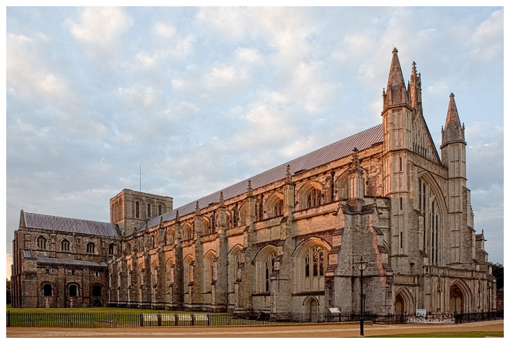
University of Southampton International Summer School 2017

This course will give you the opportunity to examine the role that these buildings played in Britain's history. You will visit the magnificent Winchester Cathedral and beautiful Hampton Court Palace.